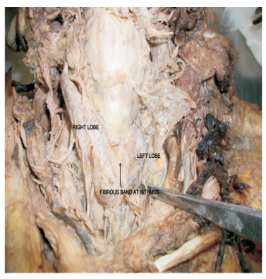
Figure 2. Female cadaver showing large right lobe and small left lobe with absence of isthmus.